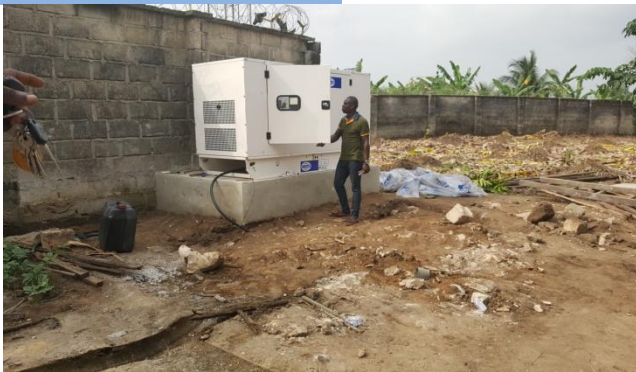
Figure 1: 100 kva generator delivered to El-Olam Hospital

Please Note: All donations for Love Missionary Outreach are received and deposited in compliance with IRS regulations and must be payable to Love Missionary Outreach. All financial gifts are tax deductible