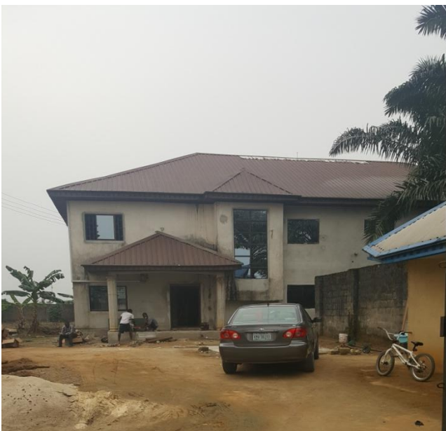
Figure 3: Front view of El-olam hospital