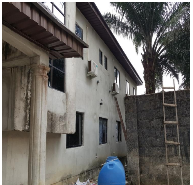
Figure 4: Side view of the hospital